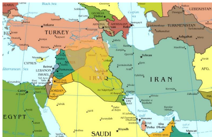
Figure 1 Assyria circa 600BC

“24 Therefore thus saith the Lord God of hosts, O my people that dwellest in Zion, be not afraid of the Assyrian: he shall smite thee with a rod, and shall lift up his staff against thee, after the manner of Egypt.” (Isaiah 10:24, KJV)